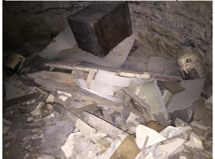
The above photo is of the basement before the cleaning.

Now some of you may wonder why we would spend $140,000.00 on a pilot project? This expense is certainly justified, as scaffolding has to be erected; the shingles have to be removed; and the wooden girdle has to be removed when we commence the restoration anyway, so this expense will not be duplicated down the road. Without the removal of the shingles and the wooden girdle, it would be literally impossible for a contractor to give us a firm quote, not knowing what could be underneath in terms of structural strength. Our Heritage consultants also feel that the shingles may be contributing to the moisture damage in the lighthouse, by trapping it between them and the original limestone. If this is the case, the shingles may be dispensed with, and the original limestone structure left as it was originally constructed – but with some stainless steel support rods inside the lighthouse walls and of course, new grouting using today's technologies. This will all be determined as things progress.