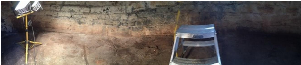
This photo is after the environmental cleanup of the basement.

PRESQU'ILE POINT LIGHTHOUSE PRESERVATION SOCIETY